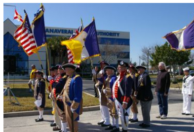
Brevard chapter of the Florida Society of the Sons of the American Revolution in front of Canaveral Port Authority building 3-06-10

at the facilities of the Canaveral Port Authority in Cape Canaveral (228 anniversary Friday, March 4 & Saturday, March 5, 2011)